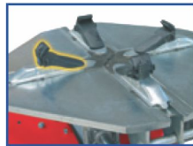
G800A98 → 20"-22"