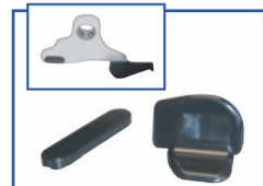
G800 A8 (2 x kit) G800 A8K (10 x kit)