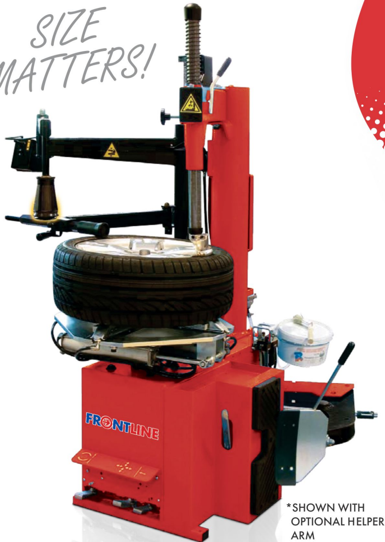
*SHOWN WITH OPTIONAL HELPER ARM